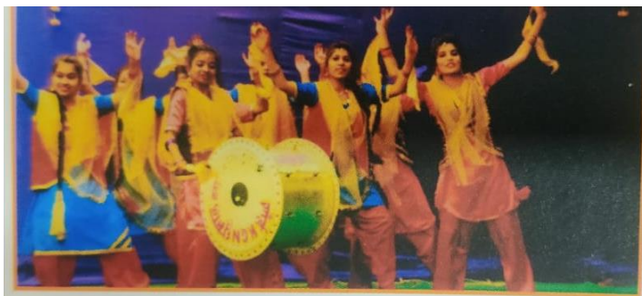
'Vedh' Group Dance

The participants, dressed in colourful costumes, set the stage on fire with their enthralling and energetic performance. The competition was a runaway hit. It increased self confidence and self-esteem in the Students. 7 teams from 7 different Colleges were participated in the activity.