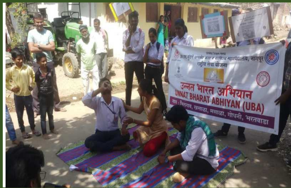
Caption: Awareness is the key to building 'Connect' with the villagers