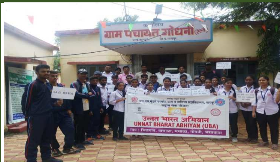
Caption: Interaction with the Gram Panchayat members was the real Eye Opener to Village issues and concerns