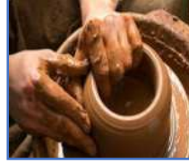
कारीगर, उद्योग और आजीविका