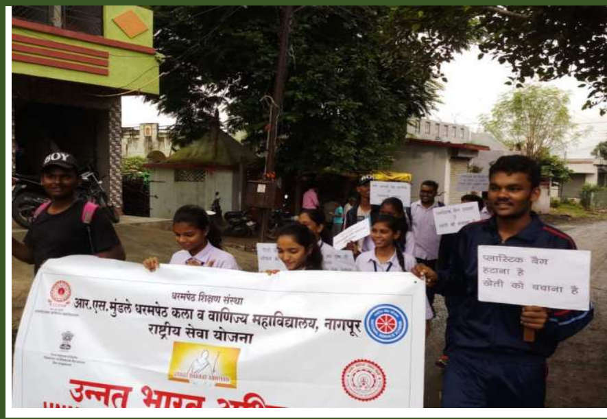
Caption: Future of the Nation( Students) key players for rural development: Students Rally across the Village as a part of cleanliness drive