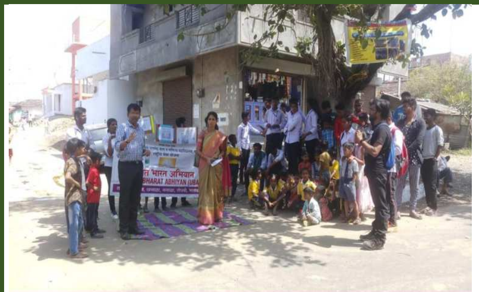
Caption: 'We are for You' talking with villagers in Gram Sabha informal meet to build a rapport to align their faith, goodwill and support towards UBA vision and mission